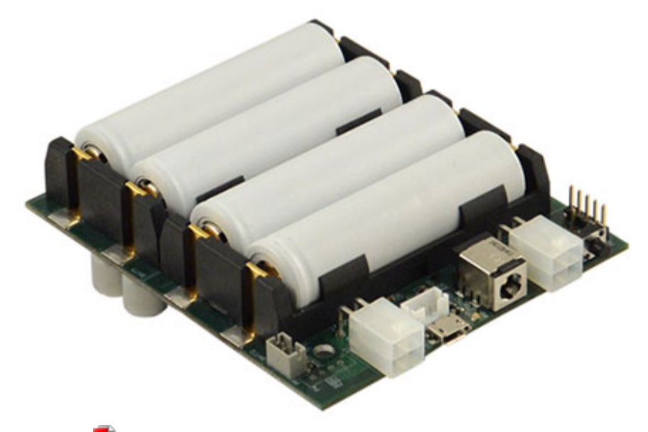
Support: Manual [EN] | API V1.0 | API V1.1